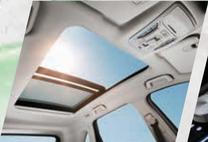
Super-size 0.42m 2 panoramic sunroof

PM 2.5 filter to produce fresh air for you and to keep you away from the impurities outside the vehicle.