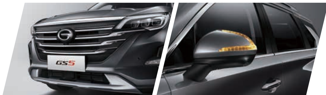
Eagle Wing 3.0 Flying Dynamics Grille

The front face imposes an impressive and elegant visual impact. The design accentuates the beauty and strength of its own form.