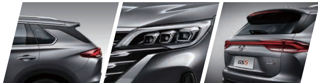
Hooked Whale Fin D-Pillar Design