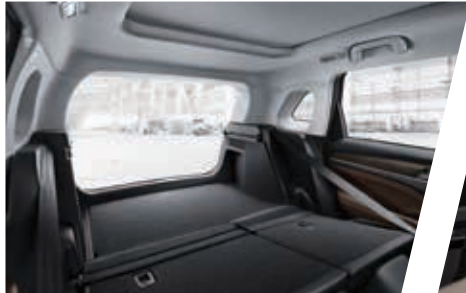
Oversized trunk space and multi-functional seat arrangements