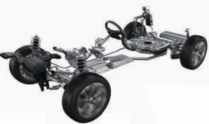
McPherson independent front suspension and multi-link beam independent rear suspension