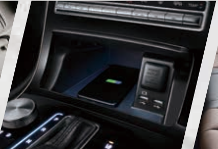
Wireless mobile charging