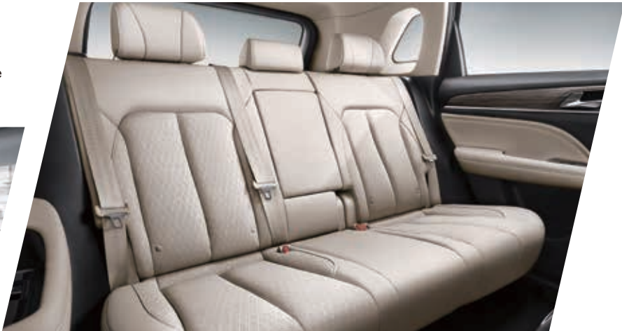
Rear seat height of 1019mm and backseat legroom of 985mm