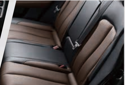
C-ECAP Gold-Medal Quality Interior