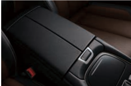
Split armrest design

The minimalist design combines practicality and beauty. By removing complexities and constraints, the vehicle maximizes its space, creating a spacious interior that is pleasing to sense and mind.